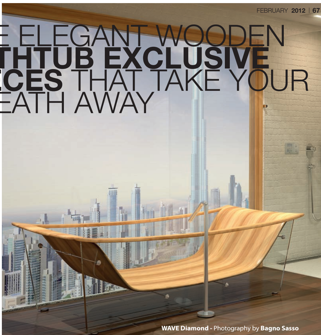
WAVE Diamond

Sweet and warm, the flowery print on this Swedish mosaic design gives it an exceptionally antique feel, like something you could have inherited from your great grandmother. Designed by Solklippa & Skogh , the claw feet in Karbad transform it from a classic design to a modern masterpiece, all the while letting it retain its warm antique persona. Bringing joy, the typical Swedish Summer flowers give the design a timeless and joyful effect; along with the claw feet it takes novelty to a whole new level.