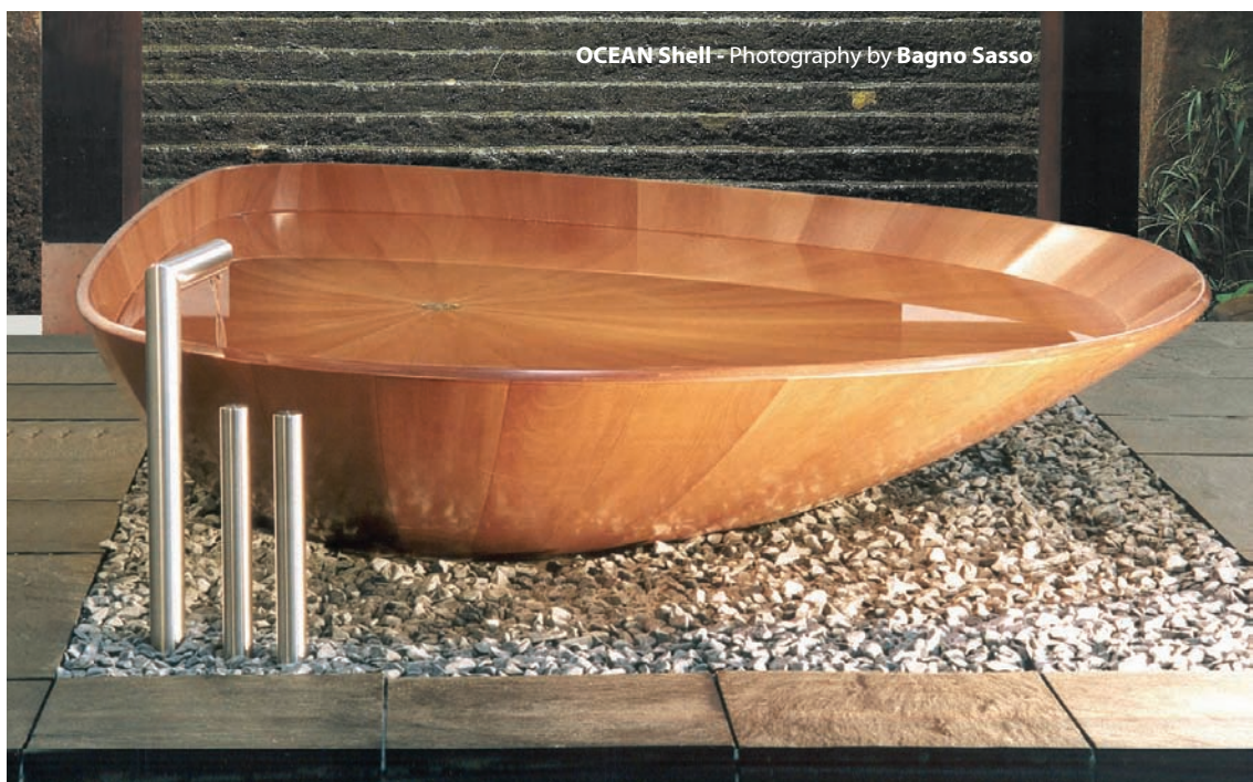
OCEAN Shell

With great design, a simple activity such as bathing can be transformed into something a lot more; a spiritual experience with the Vascabarca, a time machine to the beautiful past with the Karbad or a boat into paradise with the wooden elegant designs by Bagno Sasso, and a lot more. Bathing has become a sensational experience due to the creativity of those design masterminds! ■